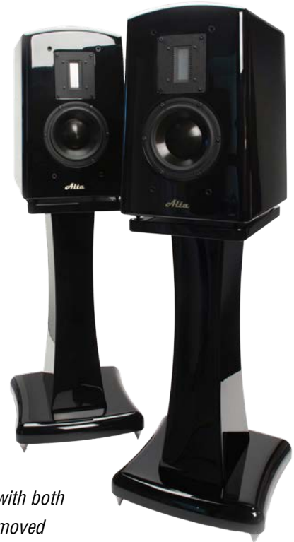
Shown with both grills removed