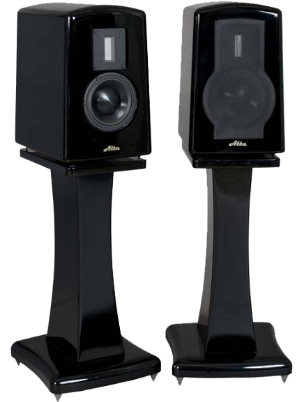
Shown with one grill removed

Designed to provide audiophile-grade, room-filling sound in smaller spaces where full-size speakers may be overwhelming, the Celesta FRM-2M outperforms other speakers at its price.