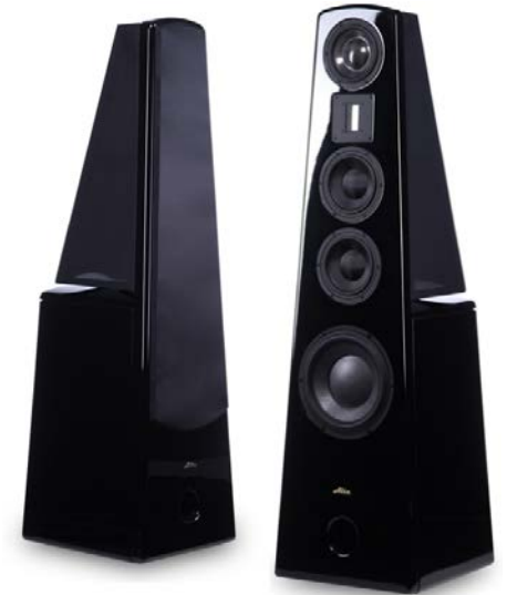
Shown with one grill removed

Titanium offers several benefits—its added stiffness allows for a larger voice, which in turn affords improved response across the sonic spectrum. Though more expensive than more common materials, the dramatic increase in performance and lifespan make it an essential ingredient in reference-grade loudspeakers.